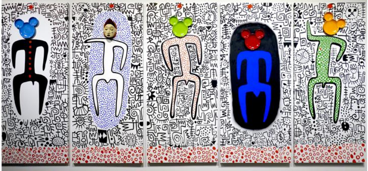
Victor Ekpuk, Mickey on Broadway , 2014 Found objects on wood panel, 5 panels 84 x 36 in. each

Ekpuk's iconography elucidates mark-making to be the motto of his artistic bent. The titles given to the works such as The Philosopher , reflect his folkloric ways of understanding the secular, to which the narratives of sacred and the profane intermix creating a creative universal expression. With his steel sculptures, Ekpuk engages the viewer in dialogue that opens up room for interpretation. The Philosopher gives the audience a beautiful multidimensional view of iconic forms in his brilliant blue color powder and imbedded with Nsibidi glyphs. Ekpuk's Mickey on Broadway incorporates found objects from Disneyland to elevate the icon of Mickey into the composition of nsibidi characters. This placement of Mickey's mask on mythical bodies of nsibidi marks brings both the subjects: marks and objects, together in one composition – an unusual gesture for the artist. It is indicative of a self-referential tendency in his work – one that fuses folk and pop culture.