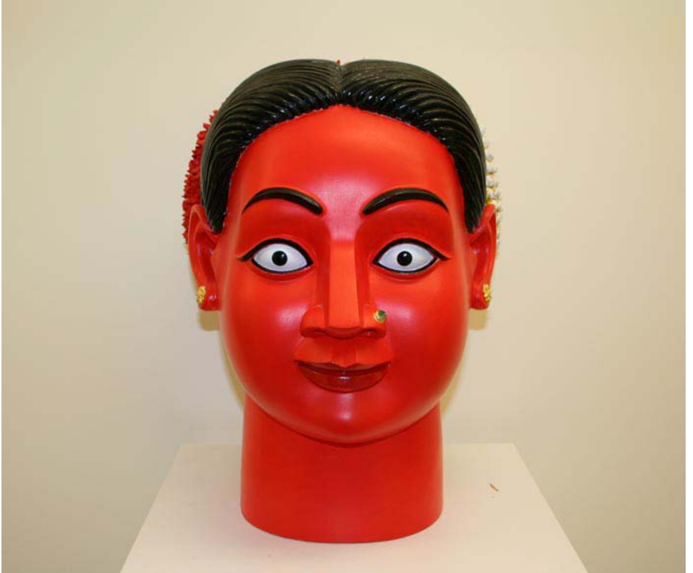
Ravinder Reddy, Head 4 , 2004, Polyester, resin and fiberglass, painted and gilded, 18 x 20 x 12 in.