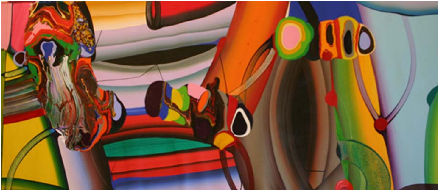
Bose Krishnamachari, Stretched Bodies 29 , 2007, Acrylic on canvas, 36 x 72 in.