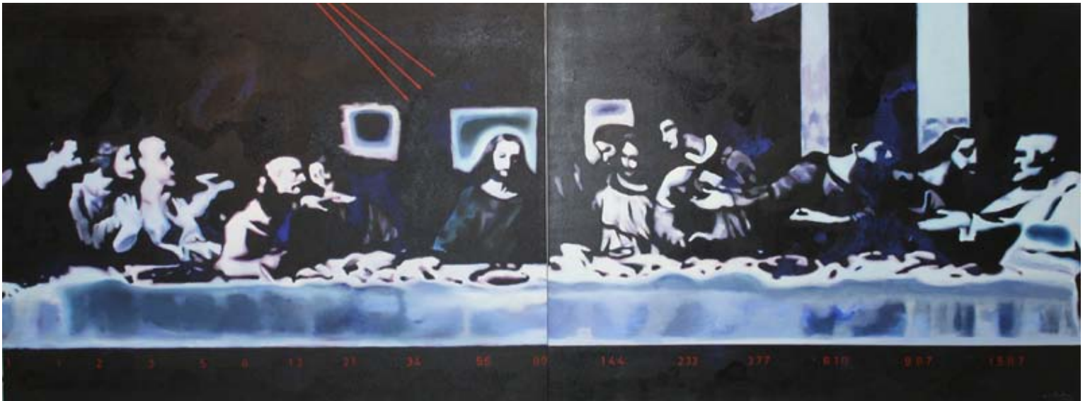
Baiju Parthan, Progression (Last Supper - After Da Vinci) , 2008, Oil and acrylic on canvas, 35.5 x 96 in.