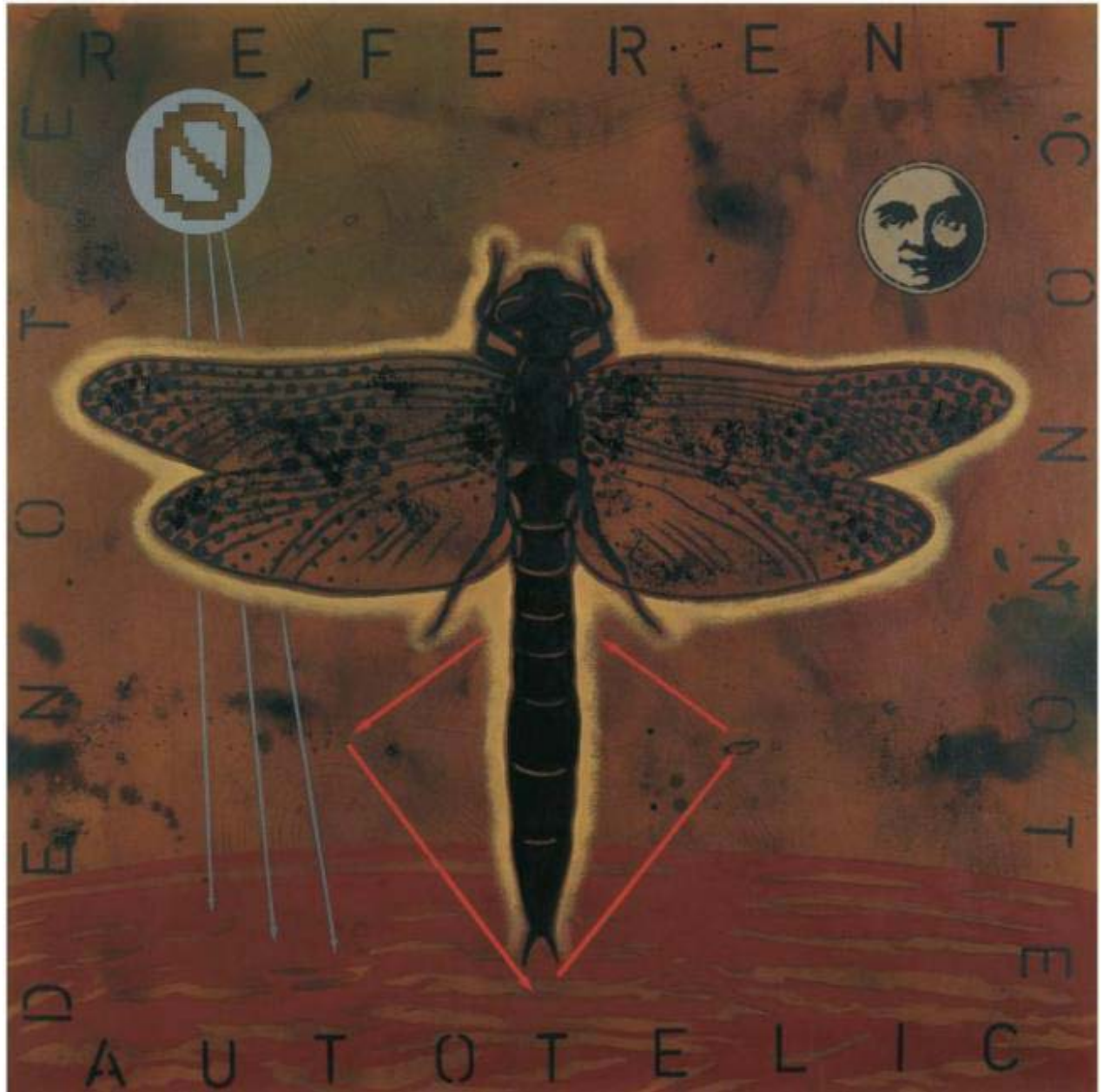
Baiju Parthan, Dragonfly , Acrylic on paper, 43.5 x 43.5 in.