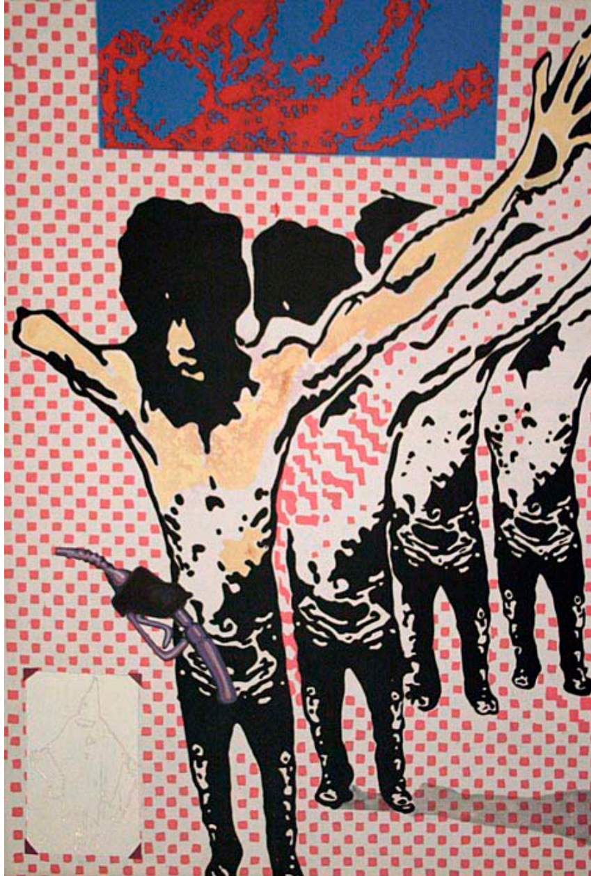
Jitish Kallat, Covering Letter 5 , 2006, Mixed media on canvas, 72 x 48 in.