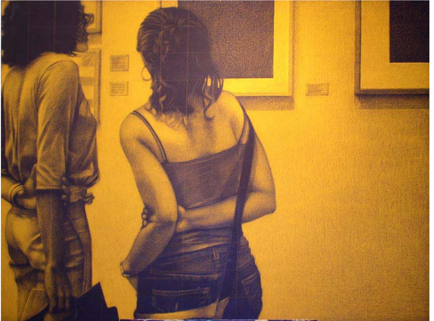
Bose Krishnamachari, Untitled (Figurative) , 2005, Acrylic on canvas, 36 x 48 in.