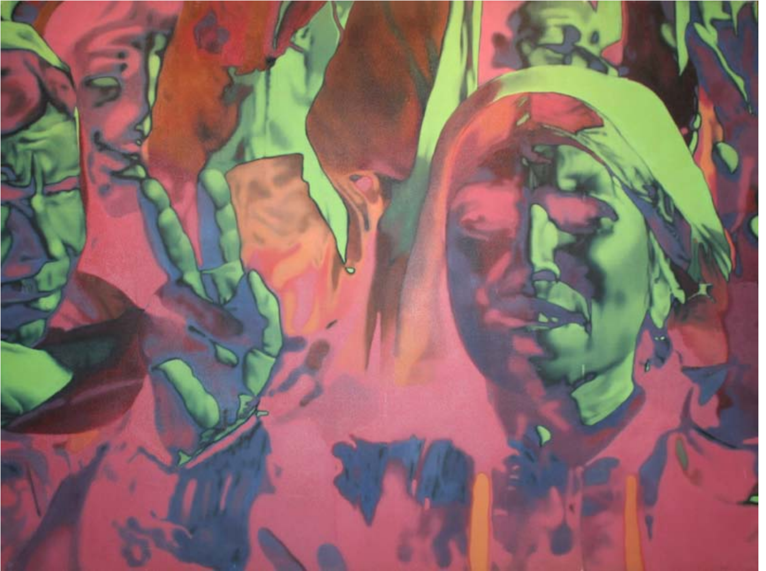
T. V. Santhosh, Spinal Cord , 2005, Oil on canvas, 54 x 72 in.