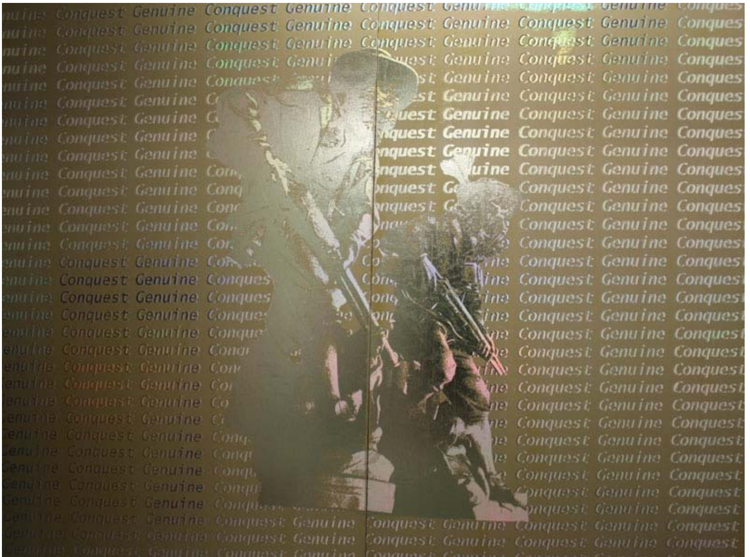
Justin Ponmany, Genuine Conquest , Acrylic and hologram on canvas, 75 x 96 in.