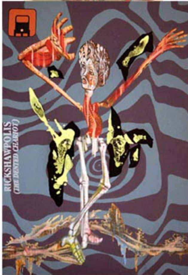
Jitish Kallat, Rickshawpolis (The Dented Chariot) , 2006, Acrylic, oil enamel and paint on canvas, 71 x 49 in.