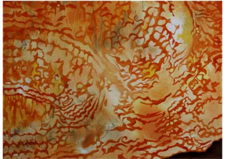
Nitin Mukul, Chandelier , 2010, Acrylic, oil and tea stain on canvas, 74 x 98 in.