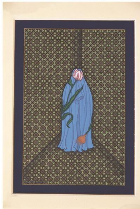
Aisha Khalid, 'Exotic Bodies'.