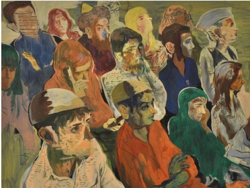
Salman Toor Imaginary Multicultural Audience 2016 Oil on panel 24 x 30 in.

Pakistan has once again made headlines in New York City, but this time it's for a good reason. Go Figure is a group show of young aspiring artists from Pakistan, showcased at Aicon Art Gallery in the East Village area of the city. The prospect of meeting Pakistani artists and art lovers in the city kept me excited for days before the inauguration. The show was exceptionally well curated, displaying highly imaginative illustrative, graphic and sensual work.