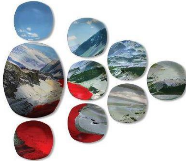
Title: Dream of Camargo - 3 Medium: Ceramic Plates with Enamel Paint, Hardener and Lacquer Installation: 9 Plates Installation Size: 31 x 27 inches Size Large Plate: 12 x 9.7 inches Small Plates: 6 x 6 inches (each) Year: 2015

Over the years Pakistani art has become a frequent presence at major art fairs across the world. The unrest and sometimes chaos in Pakistan has given a fertile space to create art with statements of peace and resistance to reactionary forces. Often, Pakistani artists have taken bold risks in creating works of art that serve as controversial in content. It is this movement which has made an impression globally.