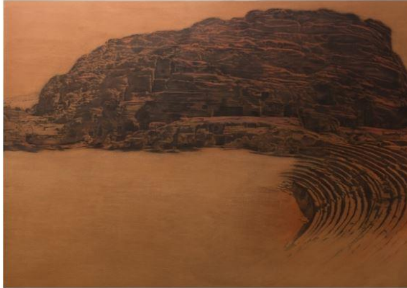
Saad Qureshi, 'All Our Yesterdays', 2014. Charcoal, pastel, Indian ink on gaboon plywood. 47 x 67 in.

All the participating artists were either trained, reside or frequently exhibit in the west. Their pictures range from imagined portraits, female empowerment, quotations from western art history, queerness and kitsch all of which was created to provoke an emotional response from viewers.