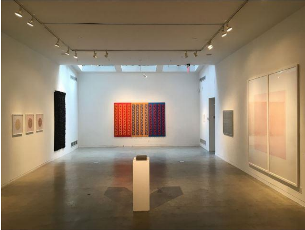
Between Structure and Matter: Other Minimal Futures , installation view. Aicon Gallery, New York.

Somnath Hore's Untitled (Wounds) (1970–73) occupied the length of one of the gallery's walls in an adjoining space to the room in which Araeen was presented. Made from a striking sequence of cast paper, the surface of each handmade piece is marked with impressions and subtle cavities that resemble fossilized lacerations, scars, slits, and abrasions on skin marred by violence. Using knives and hot iron prods, Hore cut into and burned pieces of clay that would later become models for the paper pulp reliefs. The marks, recalling the trauma of political history in South Asia, which the artist had been a witness to, act as a striking example of minimalism with a visceral, emotionally engaged, particular political content. This kind of duplicity seems to be at the heart of the practices by many of the exhibiting artists, and represents a definitive distinction from the object-oriented New York School, whose protagonists explicitly argued against metaphor or self-expression rather than focusing on bring material parts together into cohesive relationships.