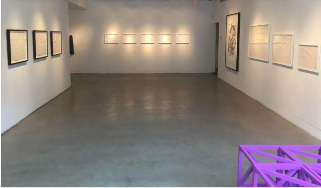
Between Structure and Matter: Other Minimal Futures, installation view, Aicon Gallery, New York.