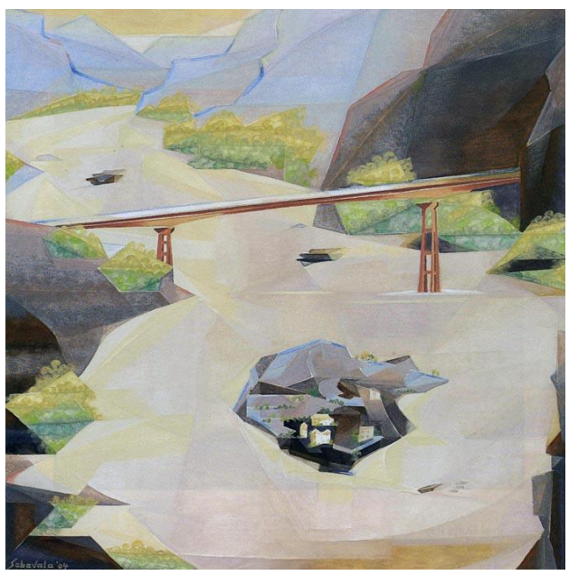
Jehangir Sabavala, 2004, The Bridge, Oil on canvas, 48 x 48 in.

AICON GALLERY is proud to present Iconic Procession: Sacred Stones to Modern Masterpieces , an exhibition of works by India's Modern Masters, alongside a selection of South Asian sculptural masterpieces and miniature paintings dating back to the 2<sup>nd</sup> century, curated by Nayef Homsi . The accompanying sculptural selection is drawn from the Ancient Region of Gandhara, Central India and Pala regions, spanning from the 2<sup>nd</sup> to 19<sup>th</sup> centuries. Together, these works showcase the primacy and endurance of mythological and tribal imagery in Indian art, while bridging nearly two thousand years of artistic tradition and cultural heritage, from antiquity to Modernism.