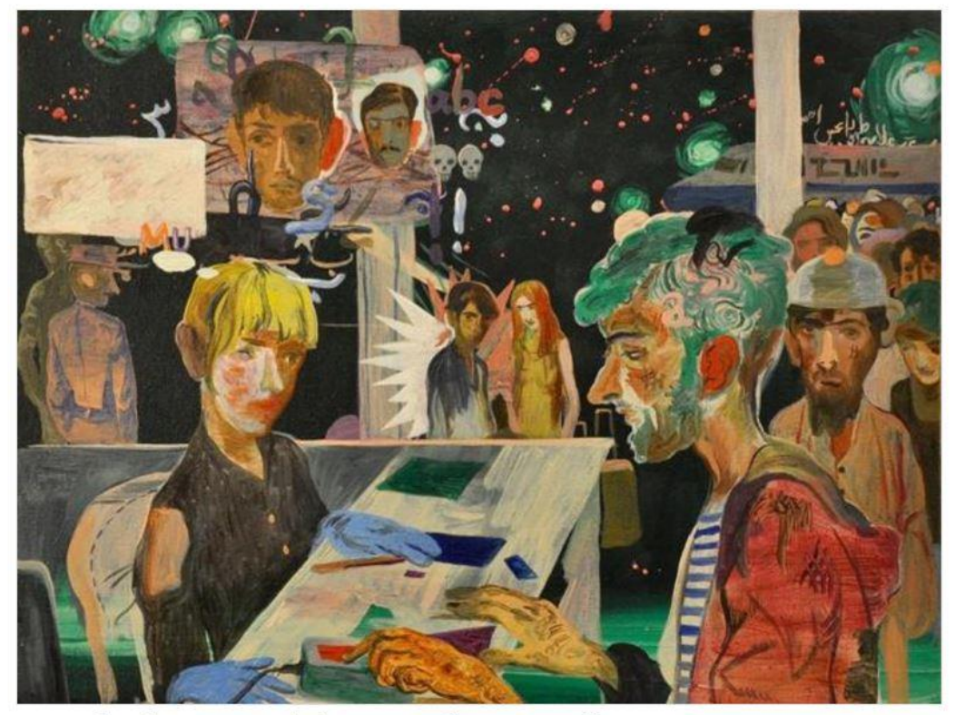
Jetsetter by Salman Toor, 2015, oil on canvas

In times of turmoil between India and Pakistan, an artistic exchange seeks to promote harmony and highlight a common culture through art.