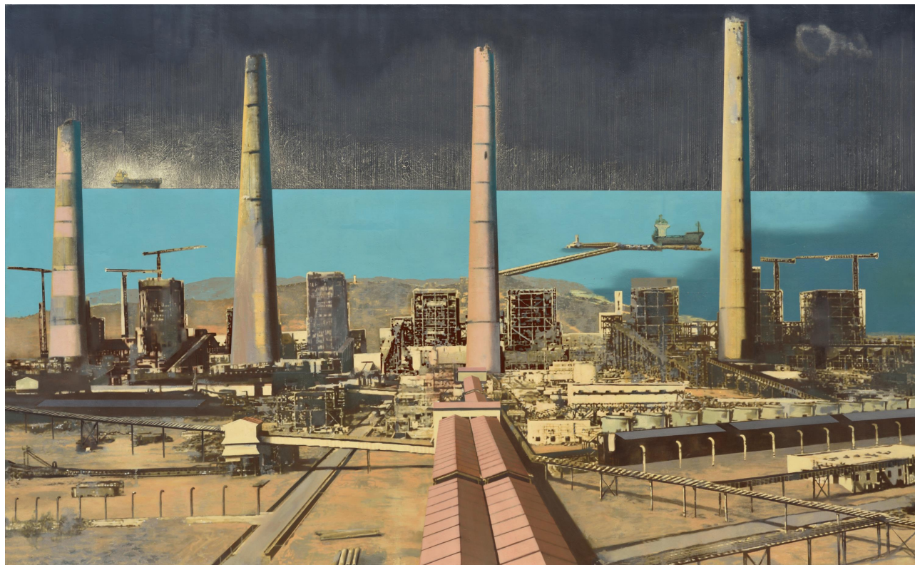
NATARAJ SHARMA Adani Thermal Power Plant , 2020 Oil on canvas 72 x 108 in 183 x 274.5 cm