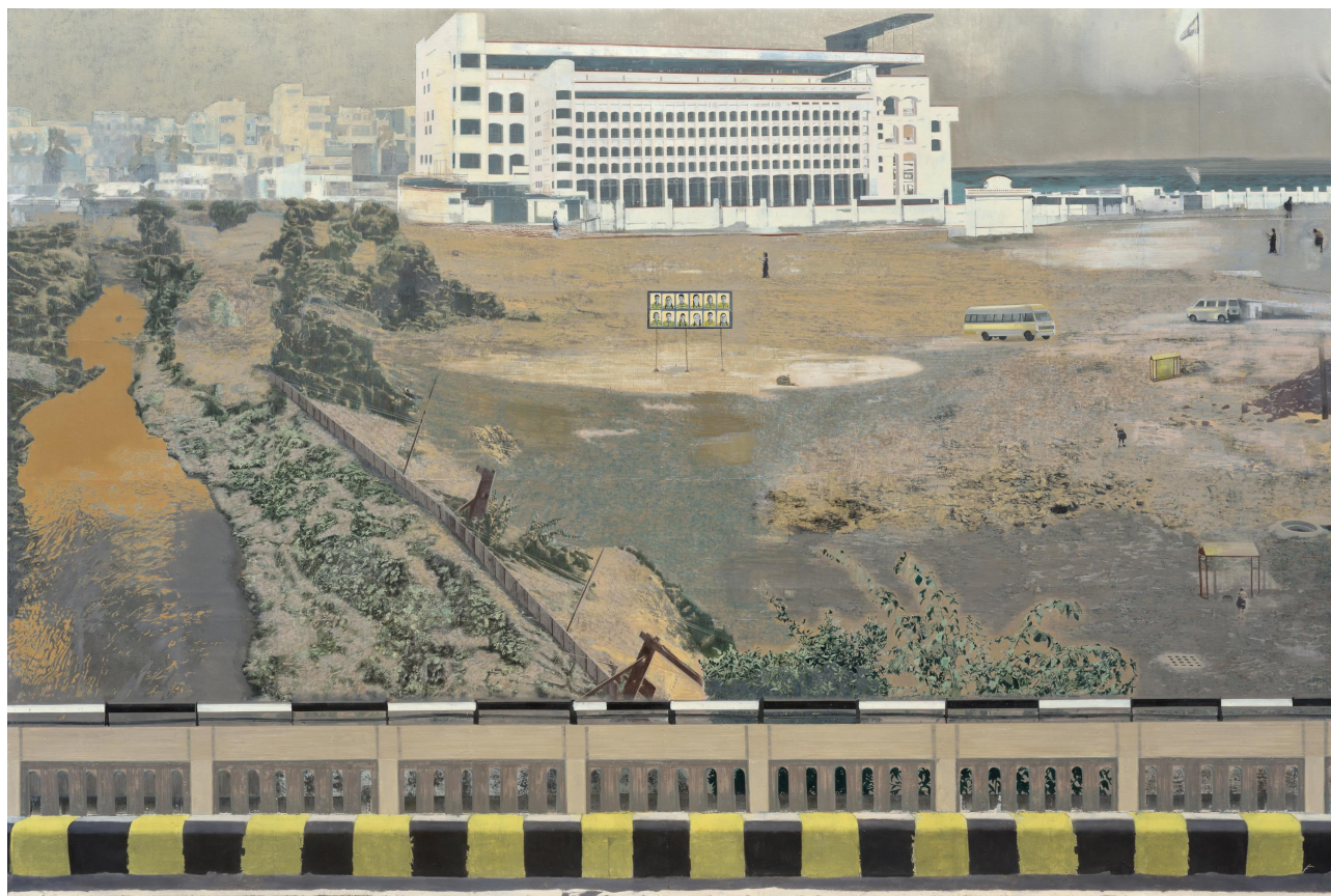
NATARAJ SHARMA Urmi School , 2020 Oil on canvas 72 x 108 in 183 x 274.5 cm