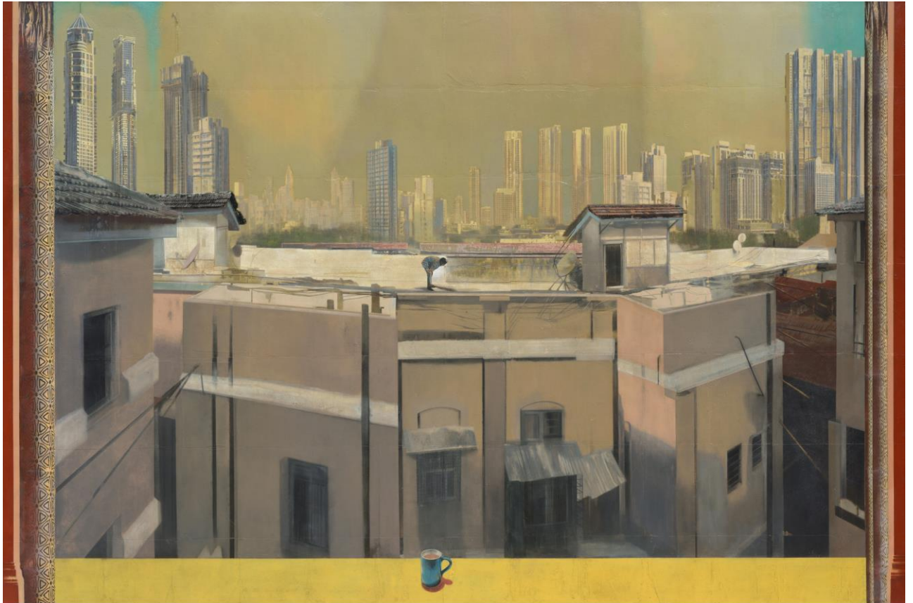
NATARAJ SHARMA View from Room 653, Byculla, 2020 Oil on canvas 72 x 108 in 183 x 274.5 cm