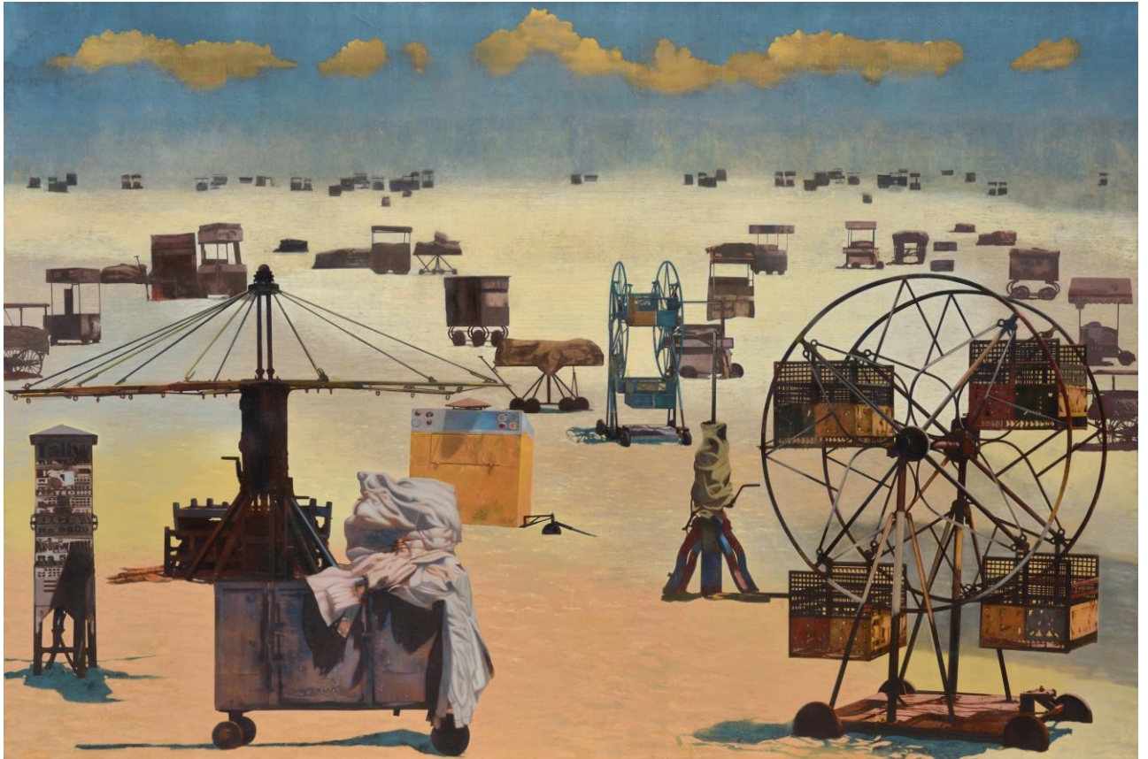
NATARAJ SHARMA Marina Beach , 2020 Oil on canvas 72 x 108 in 183 x 274.5 cm