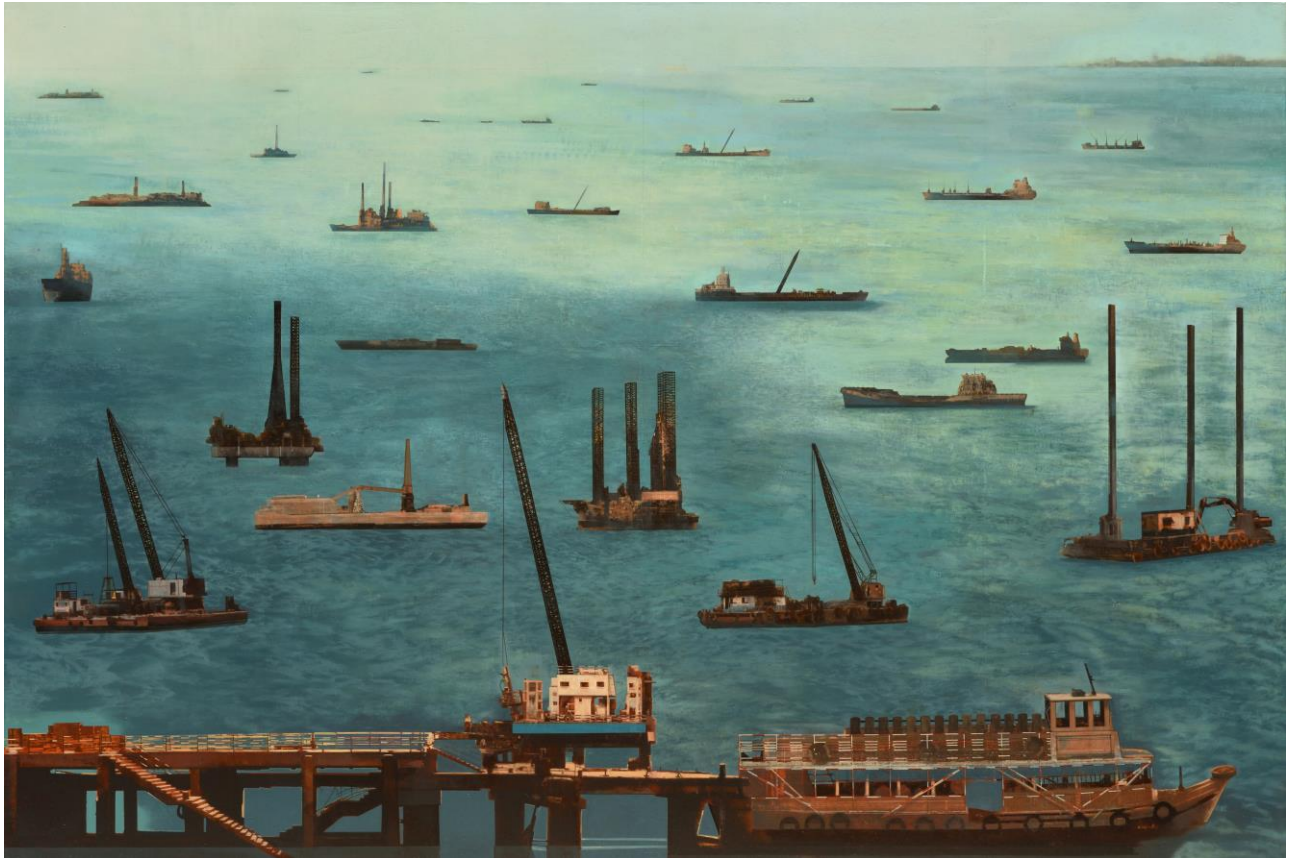
NATARAJ SHARMA Ferry to Mandwa , 2020 Oil on canvas 72 x 108 in 183 x 274.5 cm