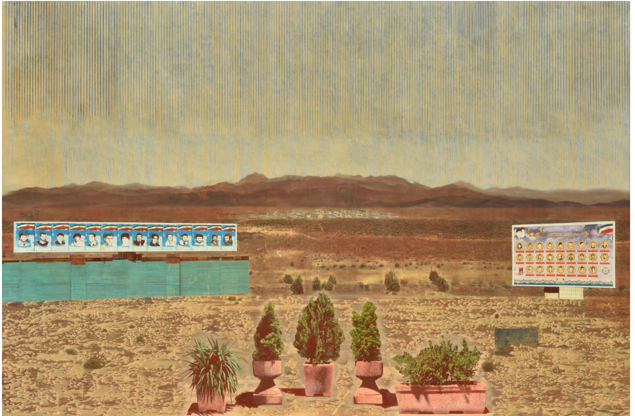
NATARAJ SHARMA Iran; Matyrs , 2020 Oil on canvas 72 x 108 in 183 x 274.5 cm