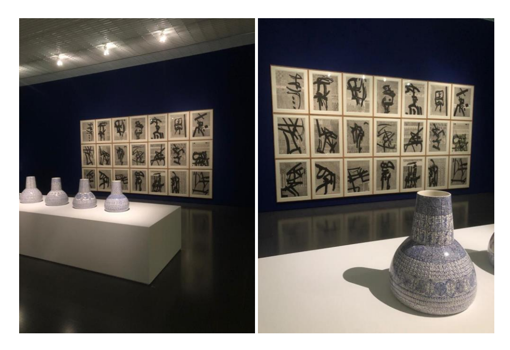
Etel Adnan dreams that writing, whatever its language and written form, can be admired "like a painting in a museum".

The exhibition juxtaposes precious old manuscripts, grouped together in three display cases, and works by contemporary artists and writers, most of which are from the Cabinet d'Art Graphique at the Centre Pompidou, in which writing is combined with imagery, sometimes even disappearing completely. This journey through inscriptions bears witness to a primordial interweaving of writing and drawing and reveals a universal vital energy. This energy circulates through gestures and lines, fragile crucibles of history, human beliefs and emotions.