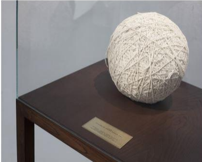
Installation view of SHILPA GUPTA's 1:2138 (detail), 2017, vitrine, brass plate and shredded garment, 157.5 x 55.9 x 50.8 cm.

Spanning painting, ceramics, sculpture and drawing, the works in the exhibition track a sort of exhaustion as well, in their formal composition and materiality. Monochromatic graphite works by Saba Qizilbash depict landscapes in Northern India and Pakistan cut through by roads, bridges and railroad tracks; their industrial subject matter and washed surfaces confer on the exhibition an indication of both the physical landscape that was split apart by Partition and also indexes this land's promise of economic output. In a similar monochromatic register, Waqas Khan's works on paper, intricately detailed in ink with delicate, detailed markings that from a distance recall fingerprints, assert that these physical landscapes are dotted with individual experiences gathered as collective histories. Ghulam Mohammad's triptych, Yaad Dasht (2018), uses unnamed family photographs as a background for laser-cut Urdu text to a chilling effect: slicing through nostalgia, the artist offers instead the gaps left by Partition's separation. Indeed, these works, in their intricacy and austerity, highlight the exhibition's insistence that the notion of remembrance—of memory as a fickle, slippery entity from which history emerges—is as much a processual and personal project as it is a collective imperative.