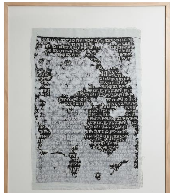
PRIYA RAVISH MEHRA, Untitled 5 , 2016, Jute fabric fragment with Daphne pulp, 62.2 x 45.7 cm.

Hanging from the ceiling of the gallery’s first room are two