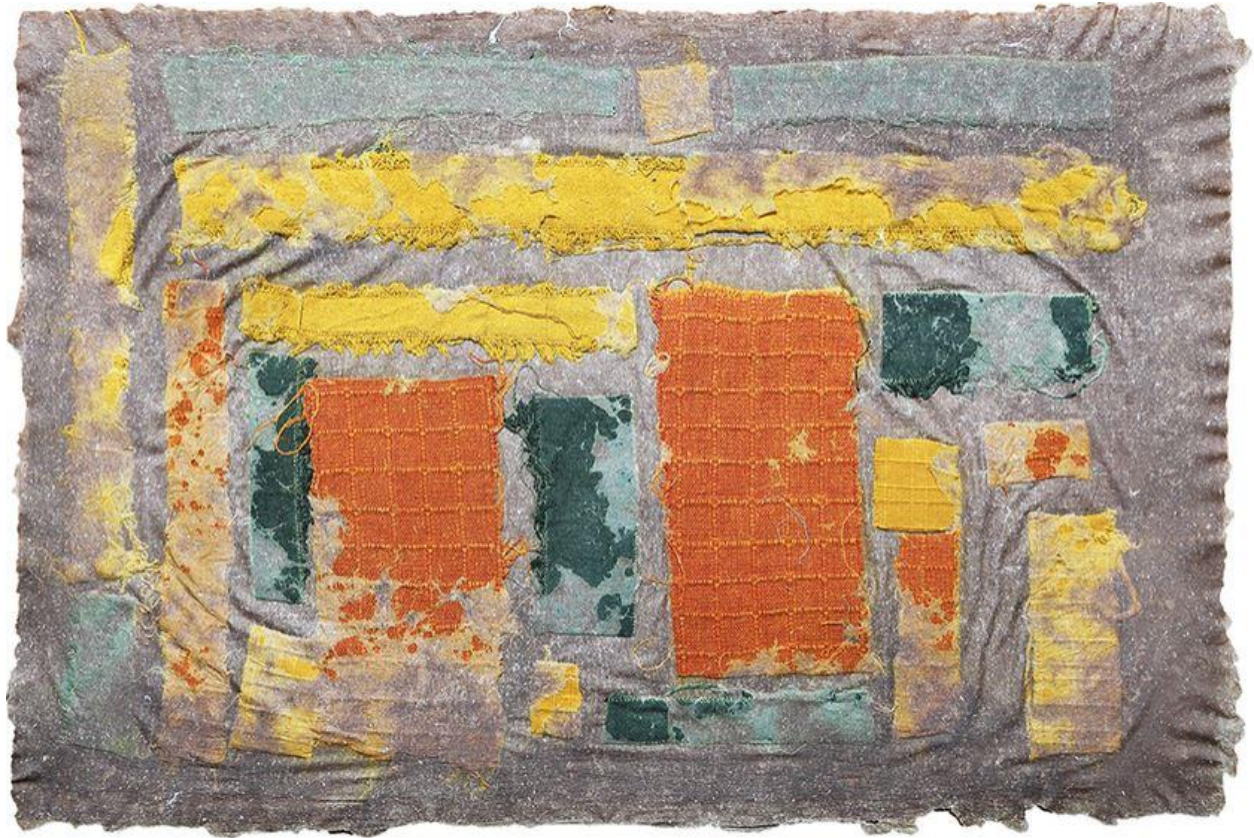
PRIYA RAVISH MEHRA, Untitled 5 , 2016, Jute fabric fragment with Daphne pulp, 62.2 x 45.7 cm.

These questions are further addressed by Priya Ravish Mehra, whose work anchors the show with its richly textured surfaces, providing an abstracted landscape in which to consider the multivariate meanings of borders, both conceptual and physical. The exhibition is in part a eulogy of Mehra—the artist passed away shortly before the show’s opening. Long associated with the practice of rafoogari , the traditional South Asian practice of darning and mending cloths to prolong their use, Mehra’s untitled works combine pashminas, cotton fabrics, jute, and paper pulp in dull, muted, matte tones interspersed with patches of bright colors. In the “Invisible/Visible” series, white paper pulp is placed on textile printed with barely legible, archaic Hindi; history as it is written is obscured, occluded and, ultimately, illegible.