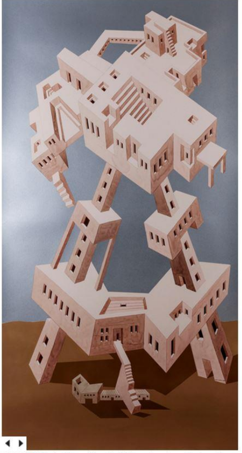
GIGI SCARIA, Ladders of Gravity, 2017, watercolor and automotive paint on paper, 147 × 77 cm. Courtesy the artist and Aicon Gallery, New York.

more generative potential of ambiguity: what can the mind make of forms without function, and of aesthetics without order?