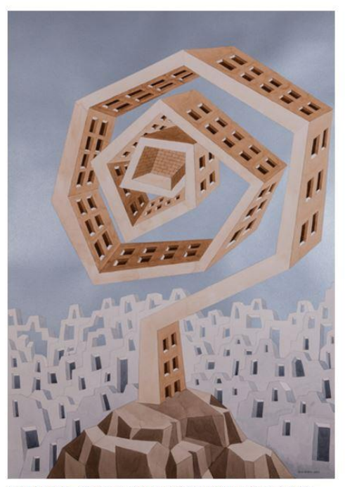
GIGI SCARIA, Center of Gravity , 2017, watercolor and automotive paint on paper, 103 × 72 cm.