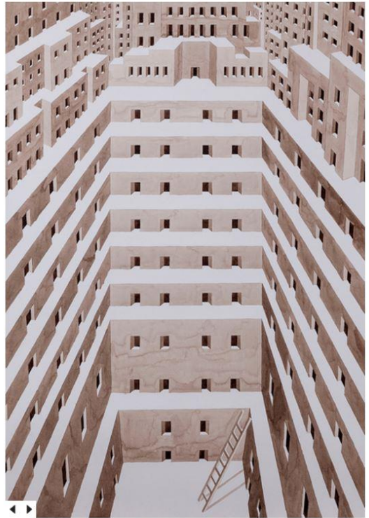
GIGI SCARIA, Core, 2017, watercolor on paper, 103 × 72 cm. Courtesy the artist and Alcon Gallery, New York.