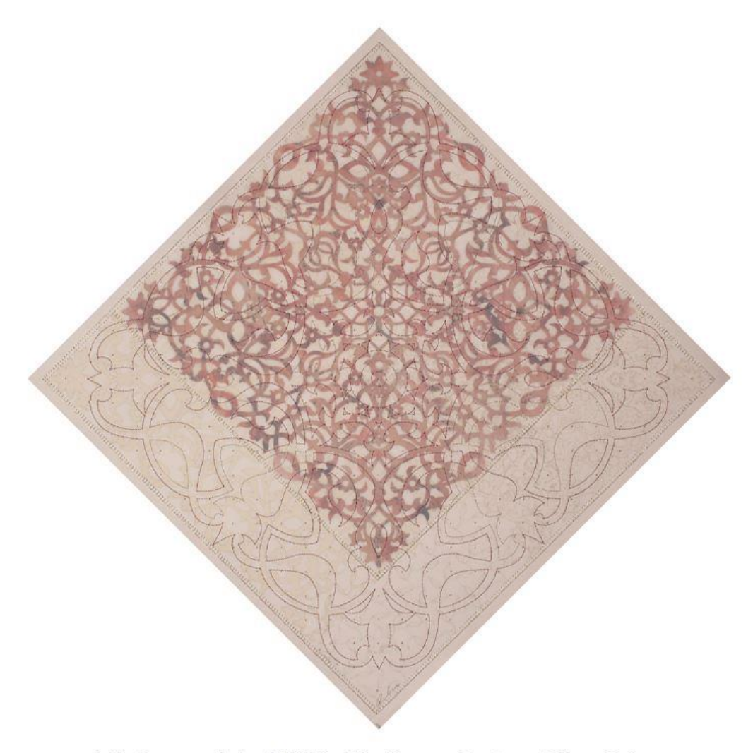
Anila Quayyum Agha, I Will Find the Flowers.

In the floral beauty of the patterns and layers, the cuts and embroidery strive to capture the identity, beauty, and femininity of my mother and other mothers—me, you, us—that become obscured by gravestone and shroud. These patterns pay homage to the organic to which death is inevitably linked but from which new life also emerges. The many colored, metallic embroidery threads in these works are often used in women's wedding dresses in Pakistan but never for shrouds. In stitching these threads into paper, and cutting patterns in steel, I connect the wedding that is believed the beginning of a woman's life-giving journey, and the funeral that is its ultimate end. This interplay of the nuptial and the funereal invites us to cherish our losses, more so because they are intrinsically connected to life's most beautiful moments such as holding a hand that may soon be no more. Together, the wedding and funeral suggest the larger cycle of life binding us through gossamer fragility and beauty of a bloom that will undoubtedly fade.